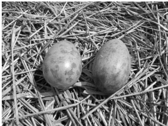
Whooping crane nest with artificial data-logging egg (left) next to a natural egg.