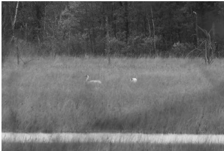
Pair of whooping cranes at their nest in central Wisconsin.

Whooping crane parents share incubation and brood-rearing duties. Except for brief intervals, one member of the pair remains on the nest at all times. Females tend to incubate at night and take the primary role in feeding and caring for the young. Although they may lay two eggs, most pairs are not able to successfully rear both chicks. Only about 10 percent of whooping crane families arriving on their winter territories at Aransas have two chicks. The second egg in a clutch may provide insurance that at least one chick survives. In nests with two eggs, the first chick hatched has the greater chance of survival. Habitat conditions, including food availability and predator abundance, affect survival. In years when habitat conditions are good, crane pairs may raise two young.