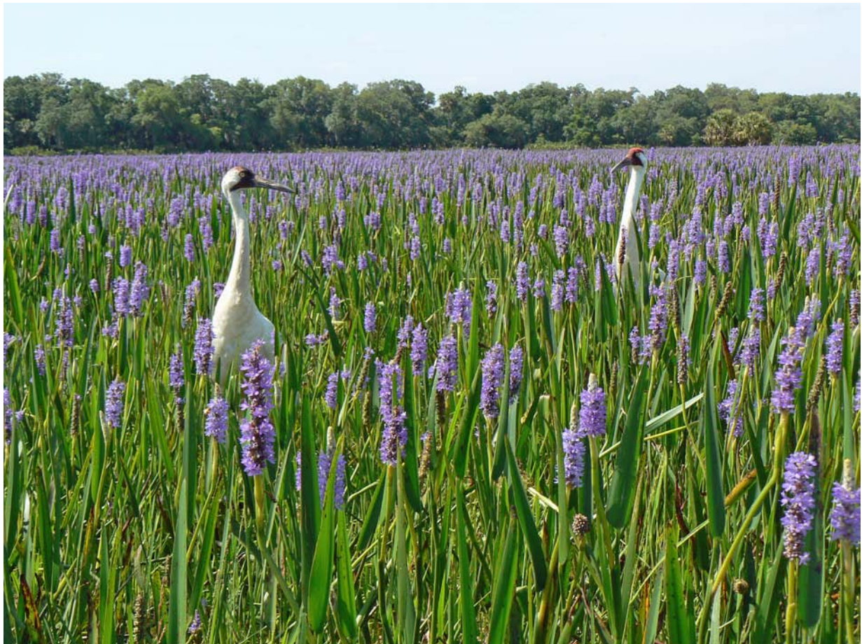
Pair of whooping cranes in a central Florida marsh. The flowers are of pickerelweed ( Pontederia cordata ).

Nonprofit Org. U.S. Postage PAID Leesburg, FL Permit No. 1040