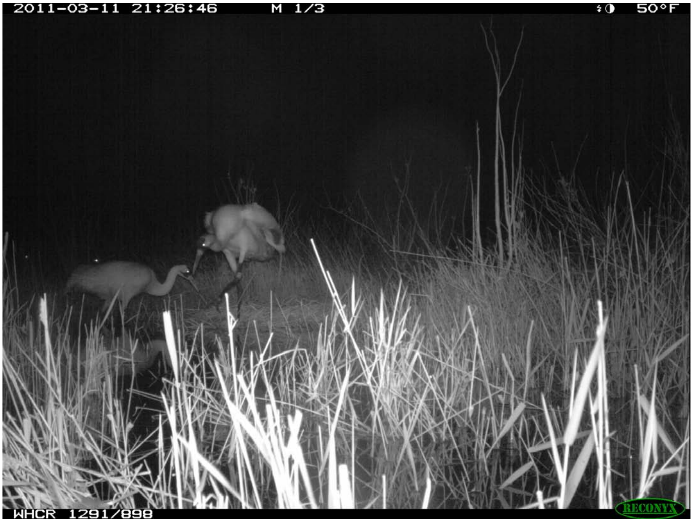
Figure 11. Pair of whooping cranes exchanging incubation duties in the dark.

Important was the documentation of the pair exchanging incubation duties in the dark (Fig. 11).