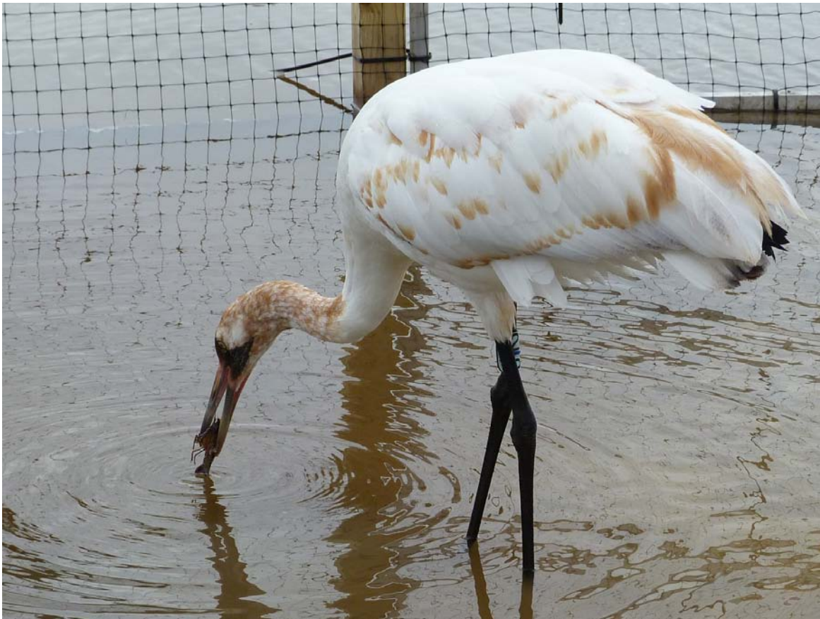
Whooping crane eats a Louisiana crawfish. See inside for article. **** Photo by Sara Zimorski, Louisiana Department of Wildlife and Fisheries ****