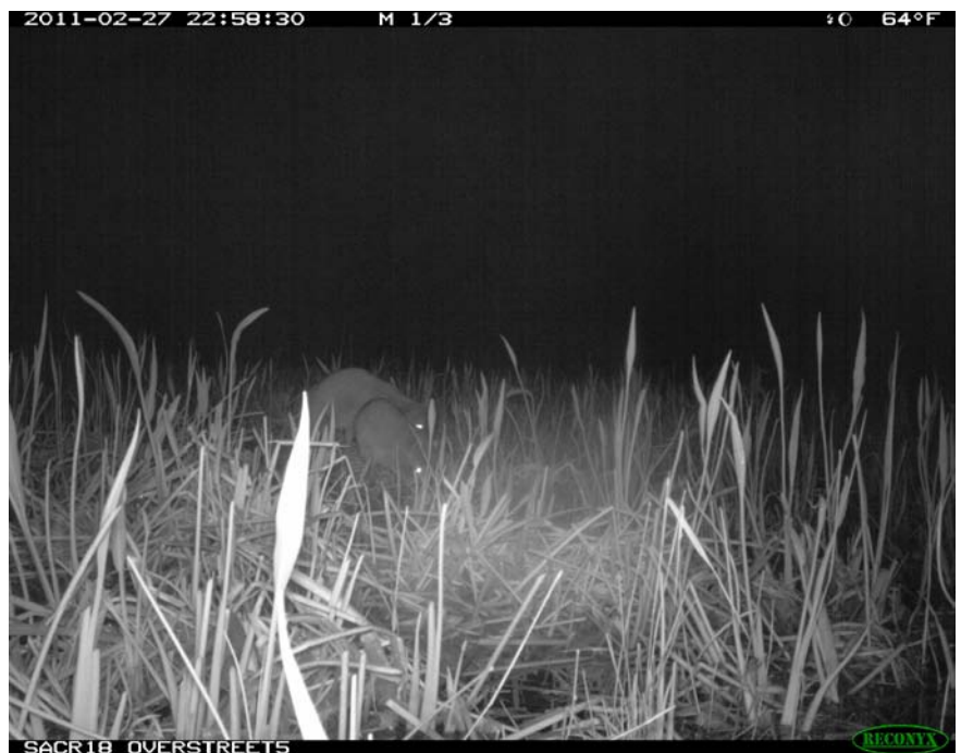
Figure 6. After a bobcat flushed the sandhill crane off its nest (previous photo), the nest was scavenged by raccoons.

Camera traps successfully documented many disturbances or potential disturbances at nests. For one nest, the last image of the attending crane was when it flushed from the nest in the dark; and then a bobcat ( Lynx rufus ) walked by the nest (Fig. 5). While the nest was unattended, raccoons ( Procyon lotor ) came and scavenged the nest (Fig. 6). Raccoons were common near nests; at one nest they triggered the camera daily. Coyotes ( Canis latrans ) and an alligator ( Alligator mississippiensis ) also were photographed.