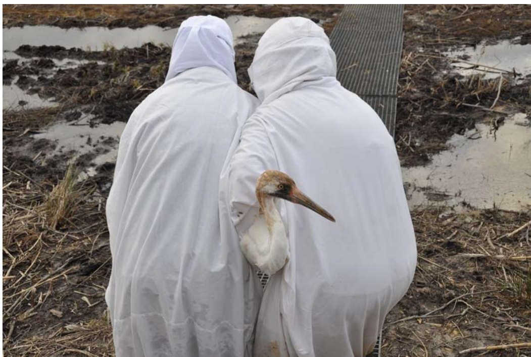
Figure 12. Costumed caretakers process a bird at the release pen in Louisiana.

Whooping cranes currently exist in three wild populations and within captive breeding populations. Captive breeding facilities are responsible for providing eggs that will eventually be released back into the wild. The 10 juvenile cranes relocated to White Lake on February 16 were raised at the Patuxent Wildlife Research Center in Laurel, Md. The eggs were hatched in May and June 2010 by birds in four locations including the Calgary Zoo in Alberta, Canada, Necedah National Wildlife Refuge in Necedah, WI, Audubon Species Survival Center in New Orleans and Patuxent facility. The young cranes were then flown to Jennings, La. and transported to the White Lake property.