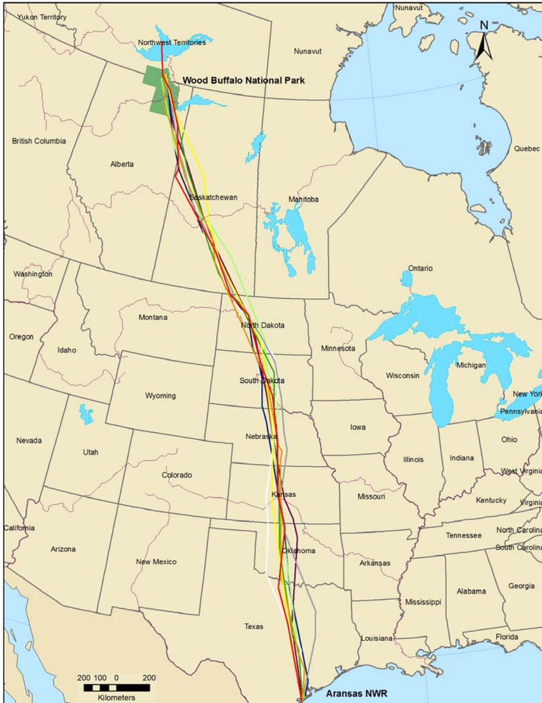
Figure 4. Spring migration routes taken by whooping cranes with gps transmitters.