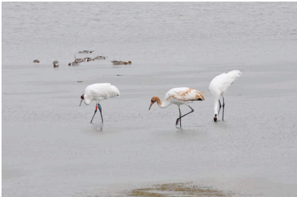
Figure 3. Whooping crane family with banded individual.

As the previous newsletter detailed, in August 2010 researchers captured nine whooping crane chicks at Wood Buffalo National Park. This ongoing project intends to answer questions regarding whooping crane migratory ecology and behavior during migration using GPS. The project uses solar Argos Global Positioning System (GPS) Platform Transmitter Terminals (PTTs) attached to tarsal bands. Birds are also marked with color leg bands similar to those used from 1977-1988. At least eight of the chicks thus banded fledged, and successfully migrated to Aransas NWR. After spending the winter months in Texas, the family groups began heading north in late March, with most of them having reached WBNP by the first week of May.