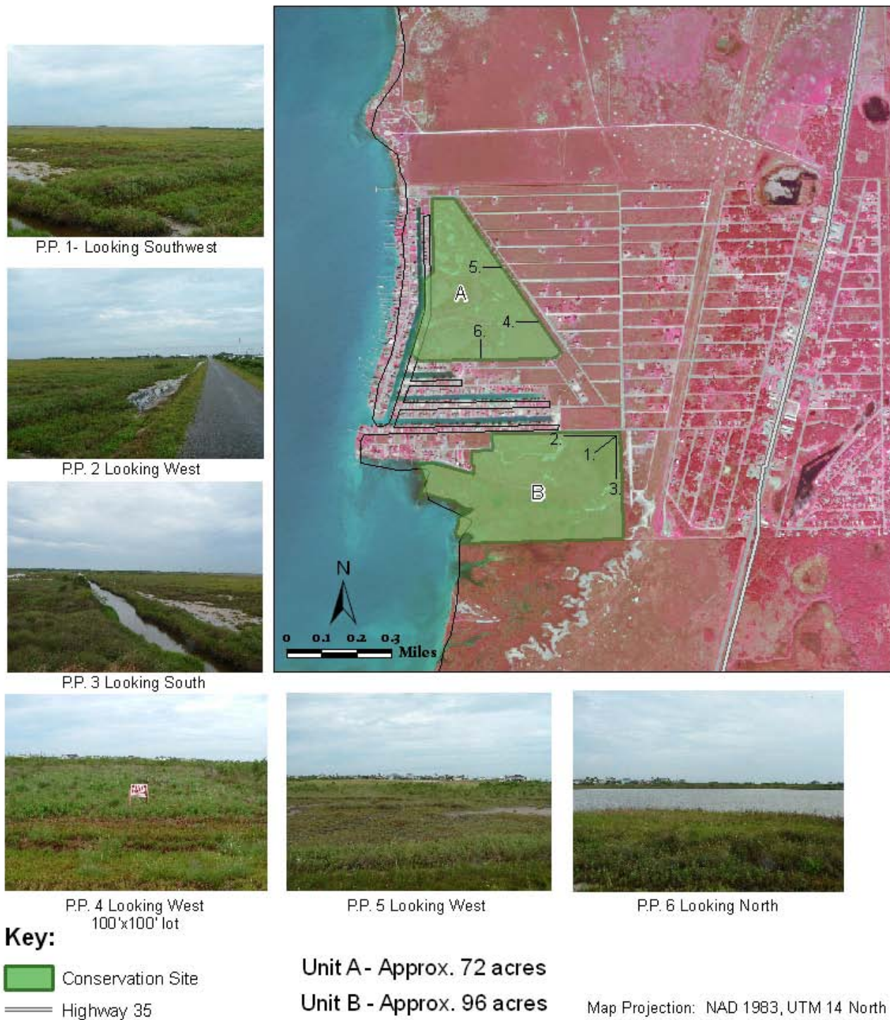
Figure 1. Whooping crane habitat proposed for conservation by the WCCA and partners.