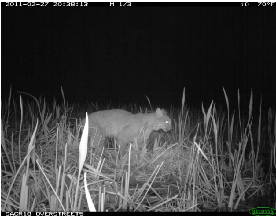
Figure 5. Image from camera trap showing a bobcat that had flushed the sandhill crane off its nest. See next image.

Most of our data so far are from sandhill crane nests and all results are preliminary. However, we are seeing some interesting results from the camera traps at nests. The cameras were useful for documenting 1) many occasions of visitors (representing disturbances or potential disturbances) to nests, 2) whether a nest was successful or not, 3) water levels at nests, and 4) behaviors of the birds at their nests. The following examples are presented in that order.