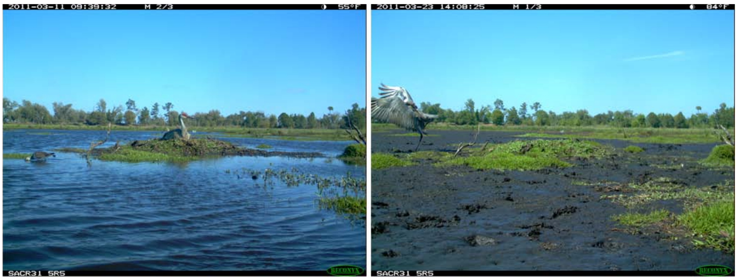
Figure 9. Images showing extremes in water levels at a sandhill crane nest. The pair abandoned the nest the day the right-hand picture was captured, apparently in response to drying of the marsh.

Camera traps also documented water levels. This is important because too much water can flood nests and too little water will cause abandonment. One nest was unique in that the nest was constructed of mud and sticks on a natural rise in an otherwise open-water pond. Extremes in water level can be seen at this nest in Fig. 9.