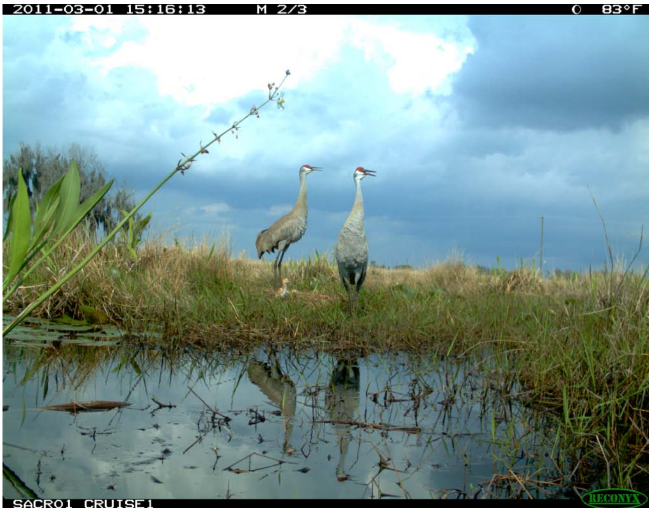
Figure 8. Successful hatch of a chick documented by camera trap.