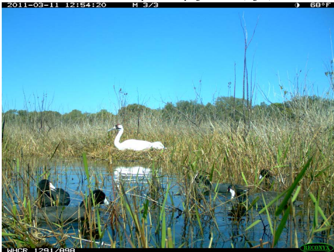
Figure 10. Photo taken by camera trap of a whooping crane on its nest. The camera was triggered by coots ( Fulica americana ).

Camera traps captured important bird behaviors. Last year we discovered from data-logging eggs that whooping cranes were sometimes leaving their nests unattended at night. This quarter we deployed the first-ever successful camera trap at a whooping crane nest (Fig 10).