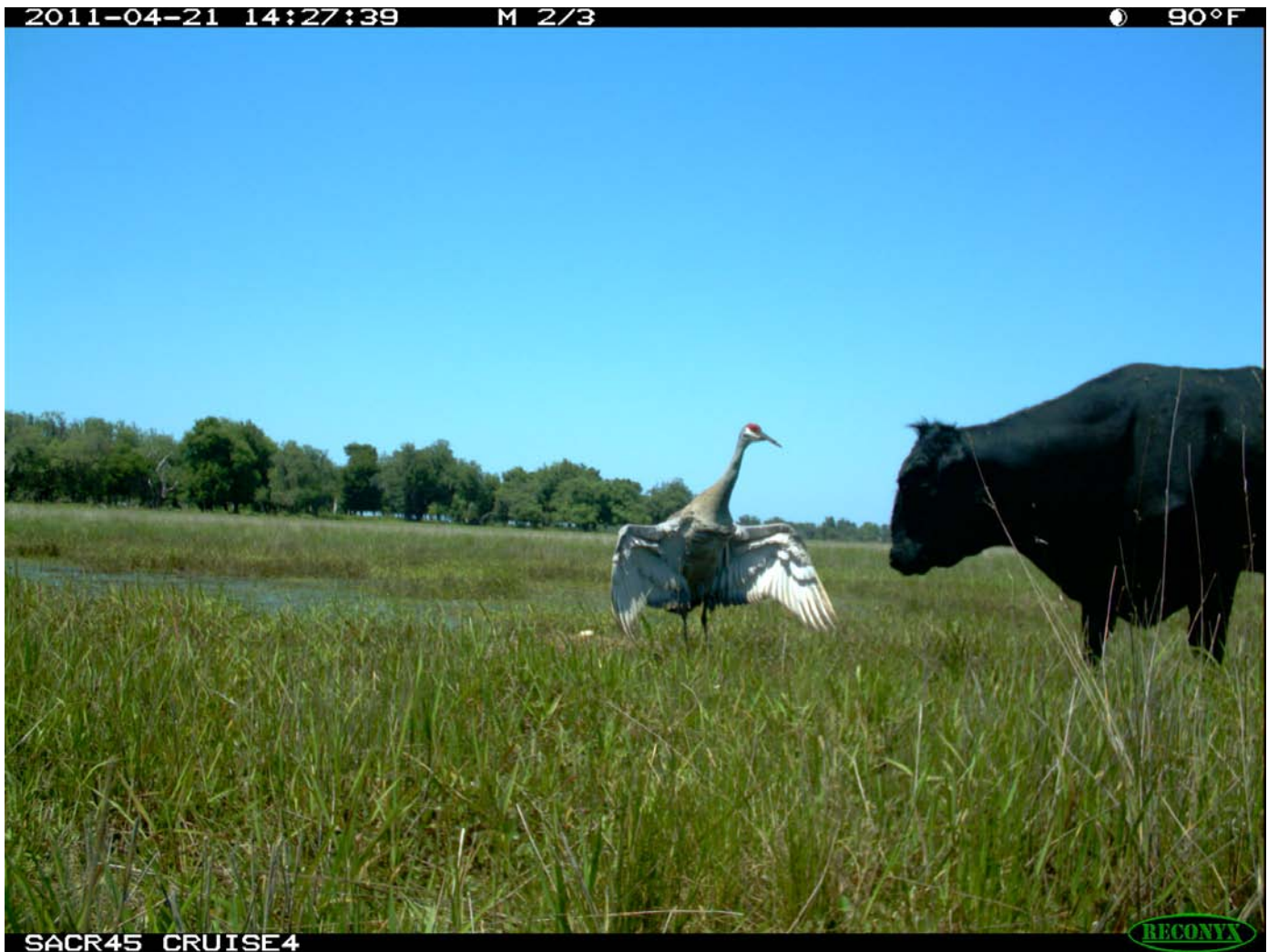
Figure 2. Sandhill crane defends nest against Angus bull (outweighing the bird by 200 times).