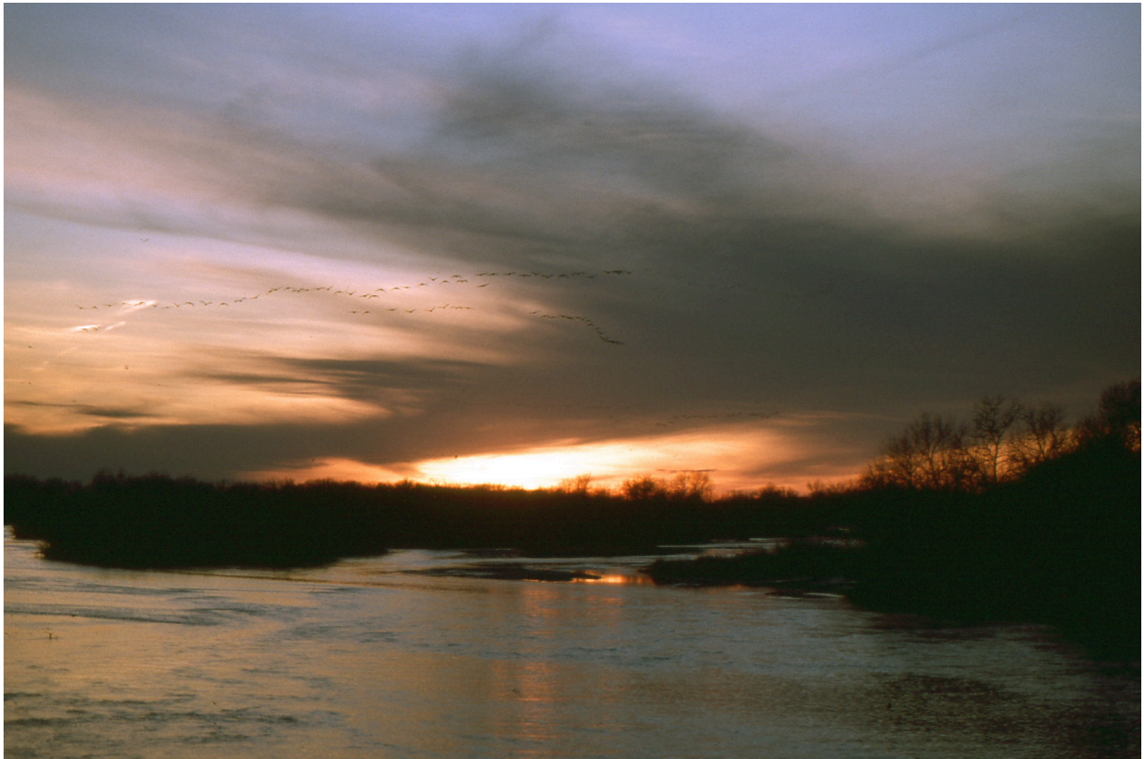
Sandhill cranes flying to roost at sunset in Nebraska.

Nonprofit Org. U.S. Postage PAID Leesburg, FL Permit No. 1040