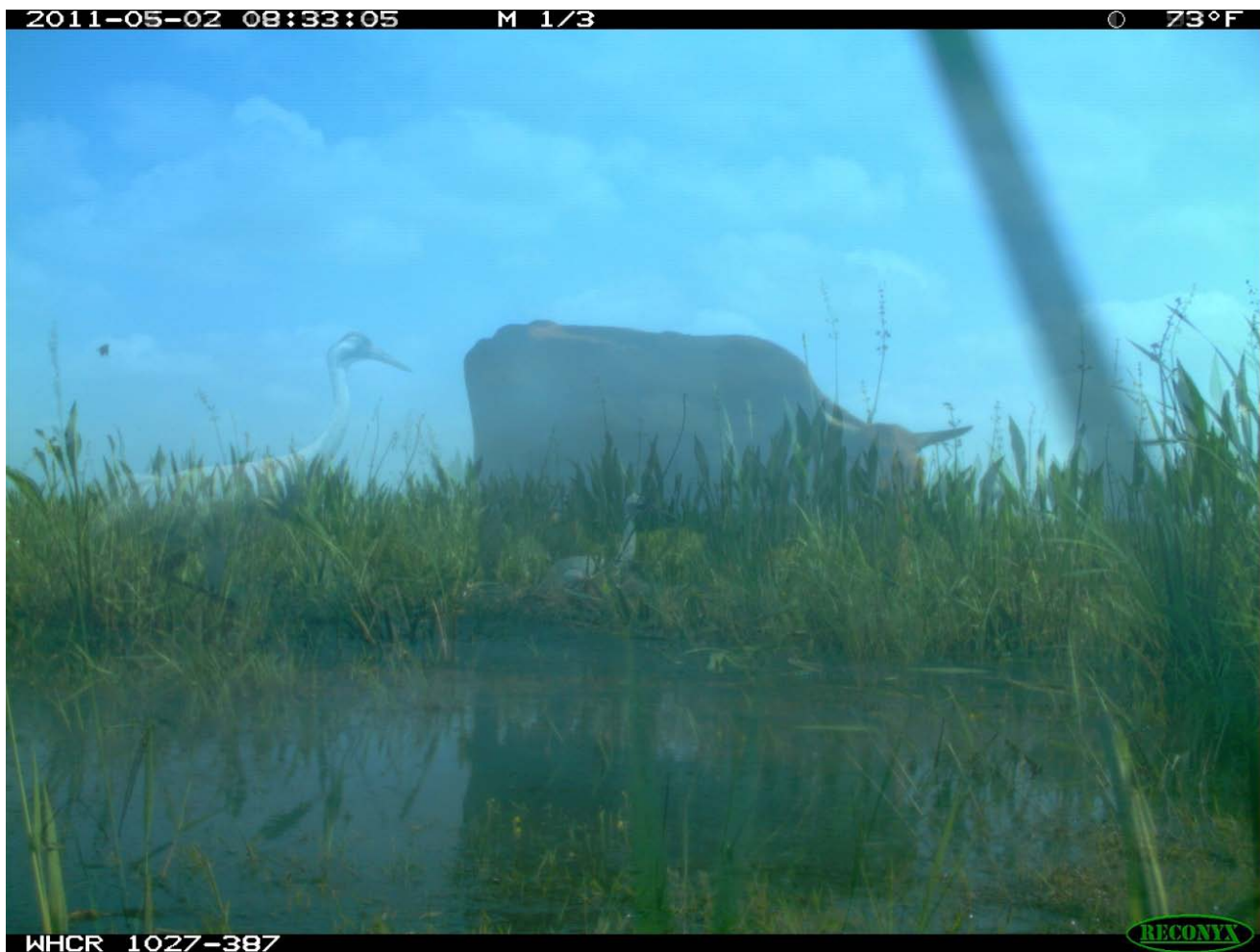
Figure 1. Composite of 2 photos showing whooping crane on nest (center of photo) with mate to left, and later the cow walking over the nest.

Camera traps also were useful in determining nest success because the eggs were often visible within the nests and could be seen to either hatch or not. Other useful information collected by camera traps was water levels at nests. Finally, cameras documented important behaviors of the birds at their nests, including exchange of incubation duties by a pair of whooping cranes at night. This work was funded in part by the U.S. Fish and Wildlife Service. ****Marty Folk, Florida Fish and Wildlife Conservation Commission, From Newsletter "The Unison Call Vol. 22, No. 1****